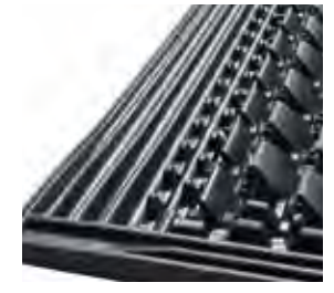
sealing lips on lower side